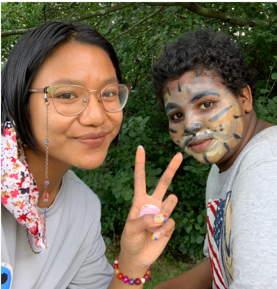
Face painting at a Summer Learning Program event last year!

Summer is around the corner and we are gearing up to provide more information on our free Summer Learning Academy partnered with Boston Public Schools. Our program targets students in the 1st- 8th grade from the Immigrant community while building on our After School Academic Enrichment Program. This summer we will be offering academic, STEM, fitness, leadership, and art. Please look out for more information in the next couple of weeks. For more information contact summerlearningacademy@acedone.org .